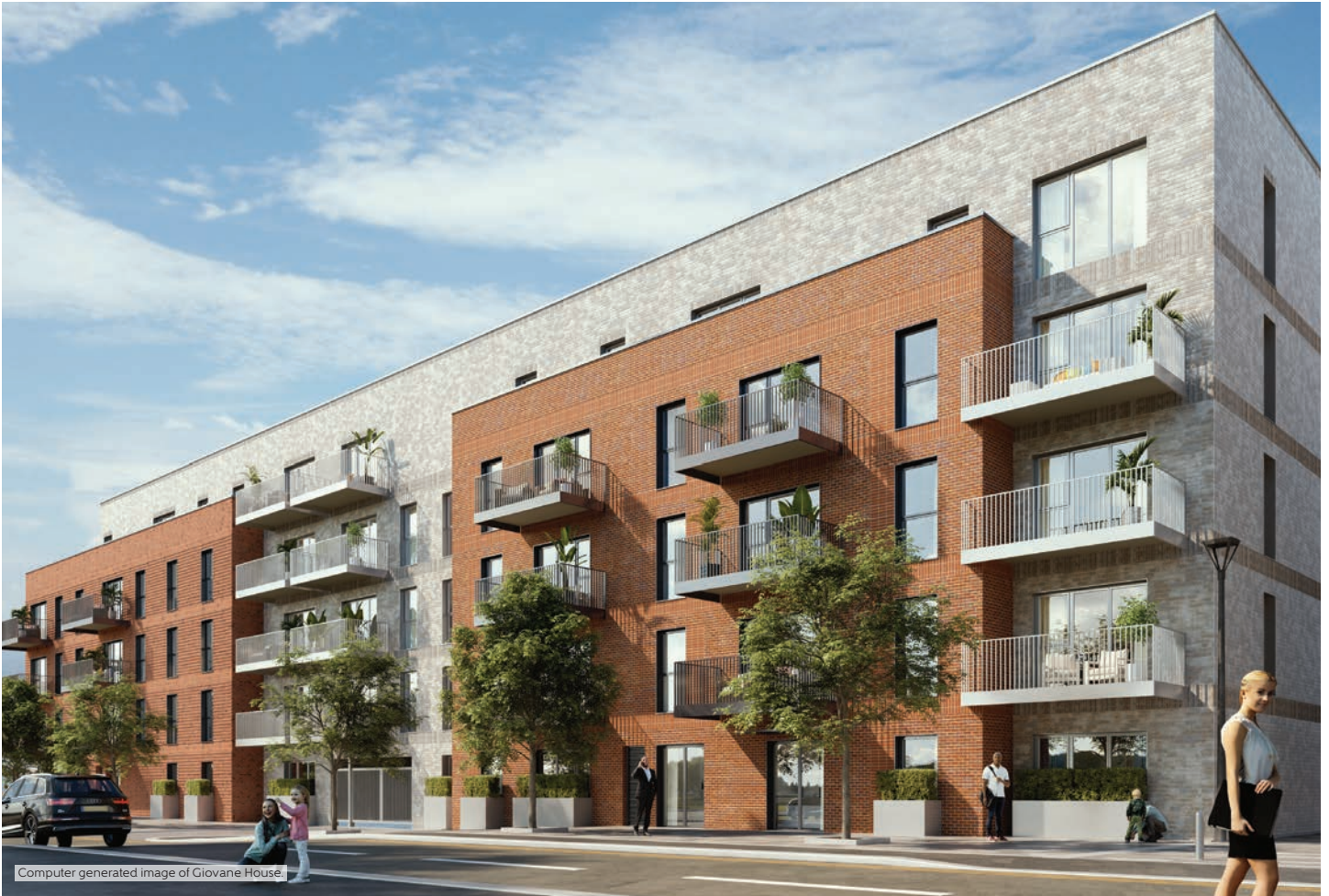
Computer generated image of Giovane House.