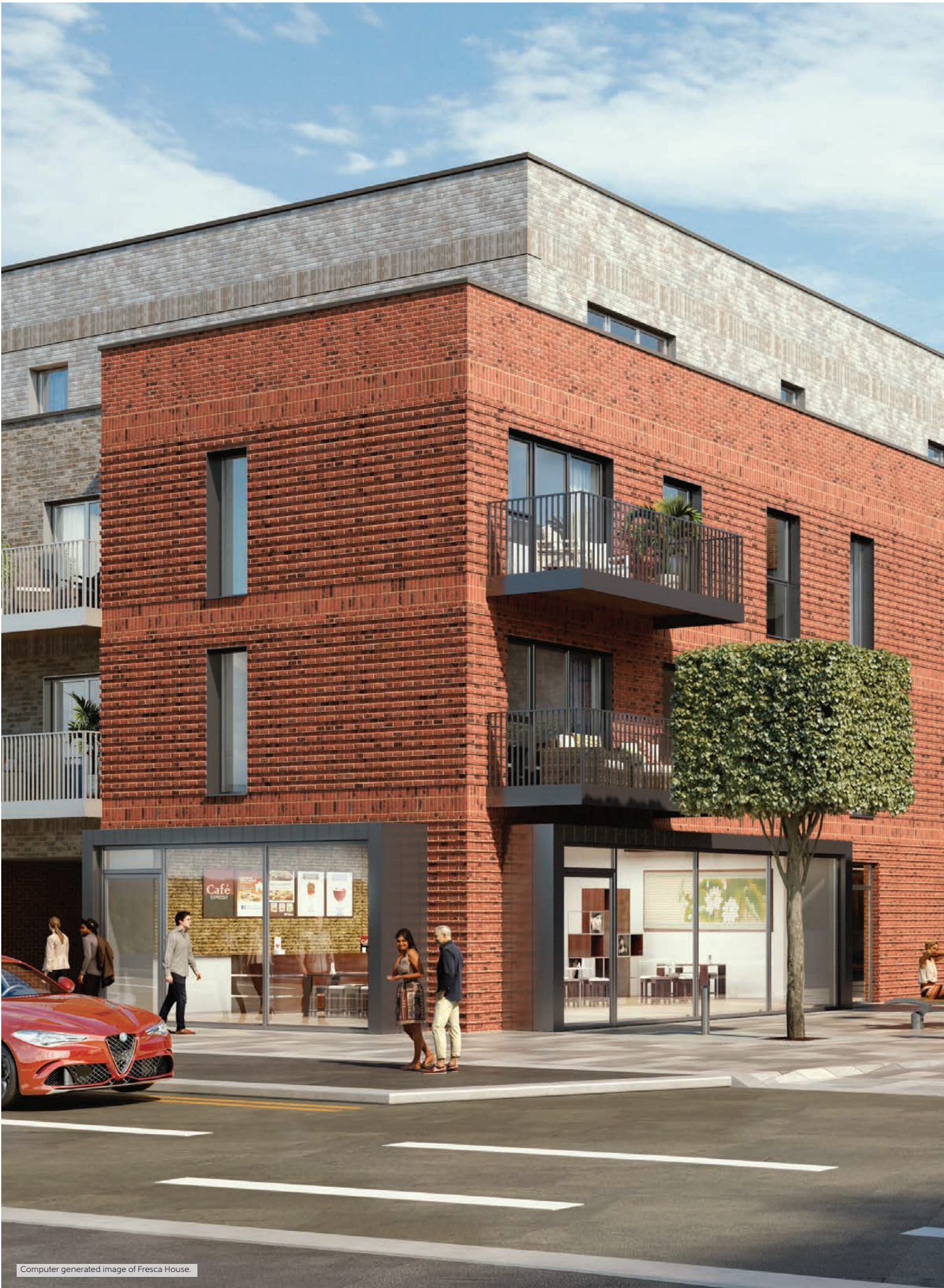
Computer generated image of Fresca House.