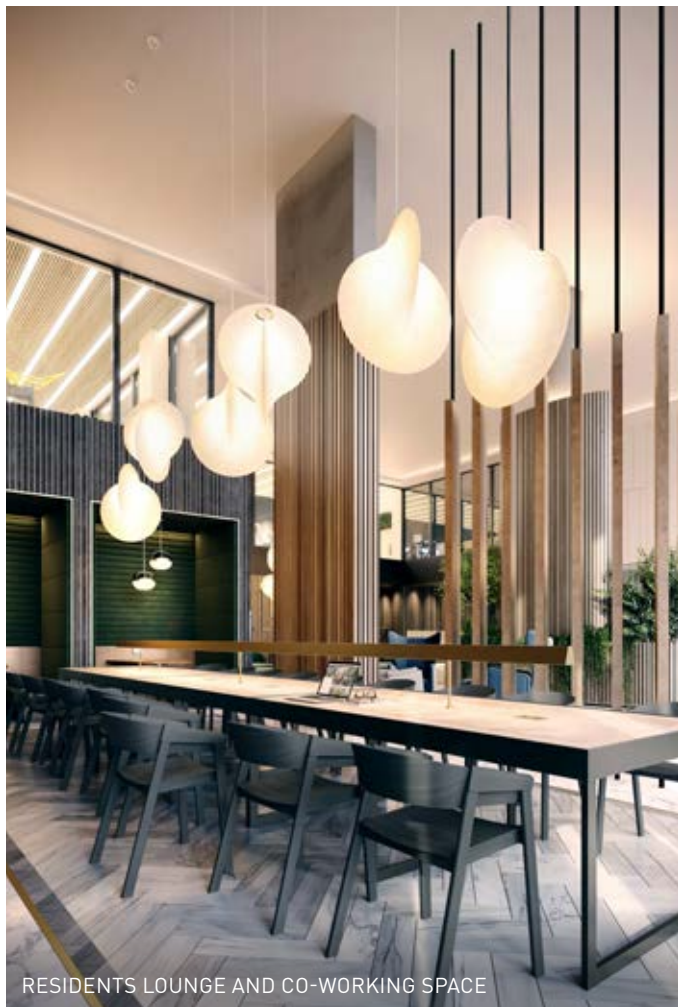
RESIDENTS LOUNGE AND CO-WORKING SPACE