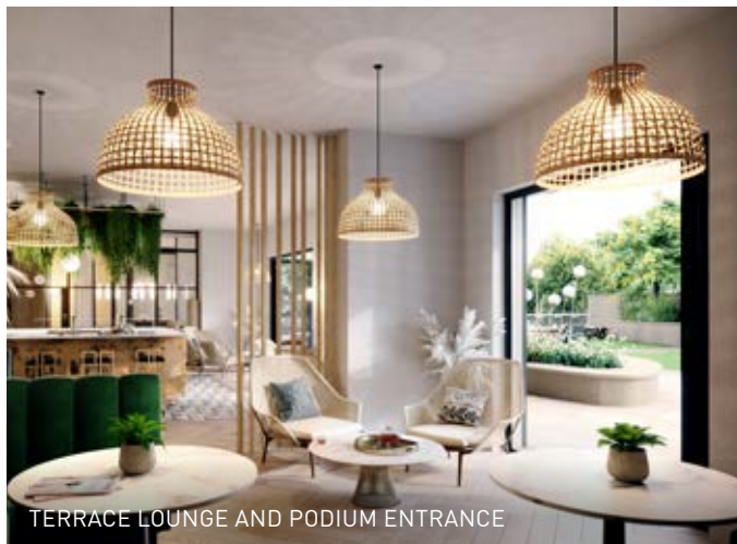
TERRACE LOUNGE AND PODIUM ENTRANCE