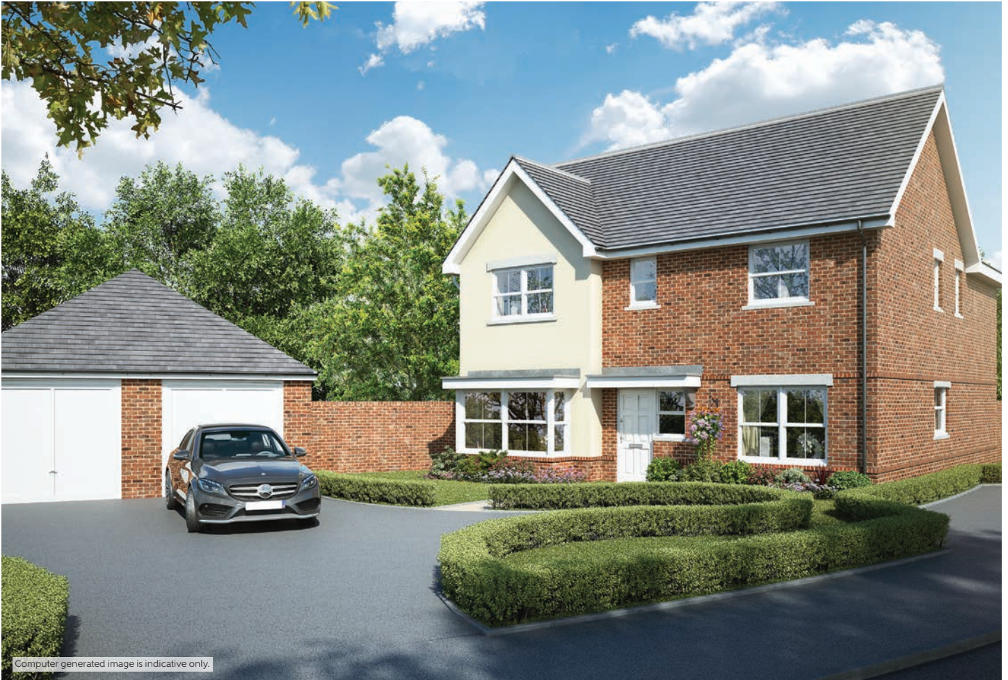
Computer generated image is indicative only.