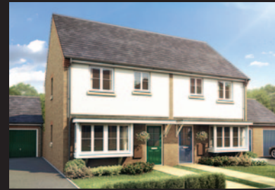
THE WINTHORPE Three bedroom house