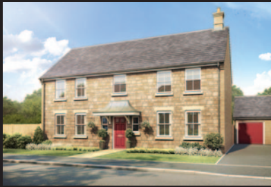
THE EDENHAM Four bedroom house