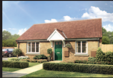
THE KIRTON Two bedroom bungalow