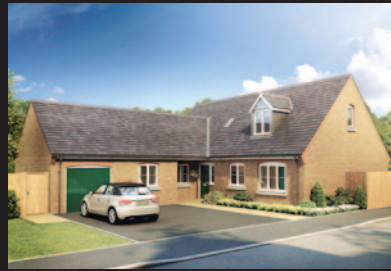
THE FOLKINGHAM Four bedroom chalet bungalow