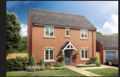
THE LINWOOD Three bedroom house