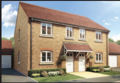
THE NETTLEHAM Three bedroom house