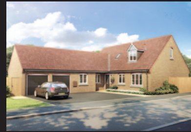
THE GRAYINGHAM Four bedroom chalet bungalow