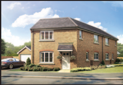
THE NEWTON Three bedroom house