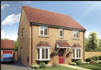
THE REDBOURNE Four bedroom house