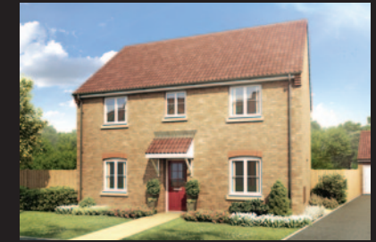
THE ANCASTER Four bedroom house