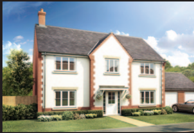
THE BELTON Four bedroom house