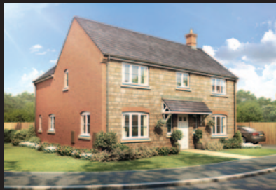
THE RAITHBY Four bedroom house