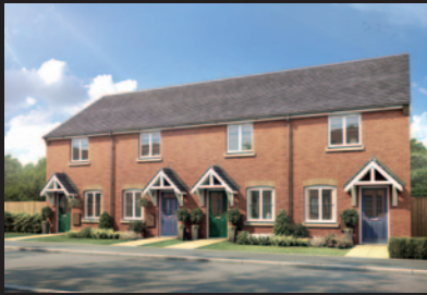
THE HEMINGBY Two bedroom house

Please see separate information sheets for more details.