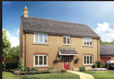
THE SOMERSBY Four bedroom house