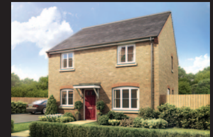
THE RIPPINGALE Five bedroom house