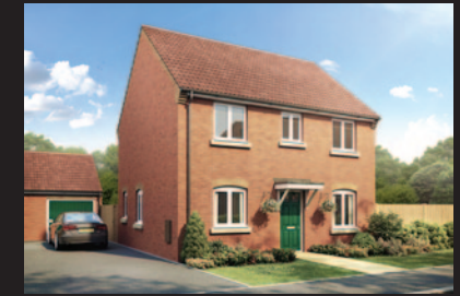
THE KEDDINGTON Four bedroom house