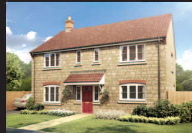
THE MIDDLETHORPE Five bedroom house