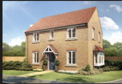
THE NORMANBY Three bedroom house