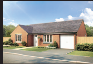
THE MARSTON Two bedroom bungalow