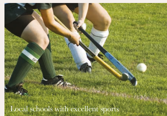
Local schools with excellent sports