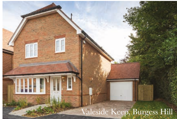
Valeside Keep, Burgess Hill