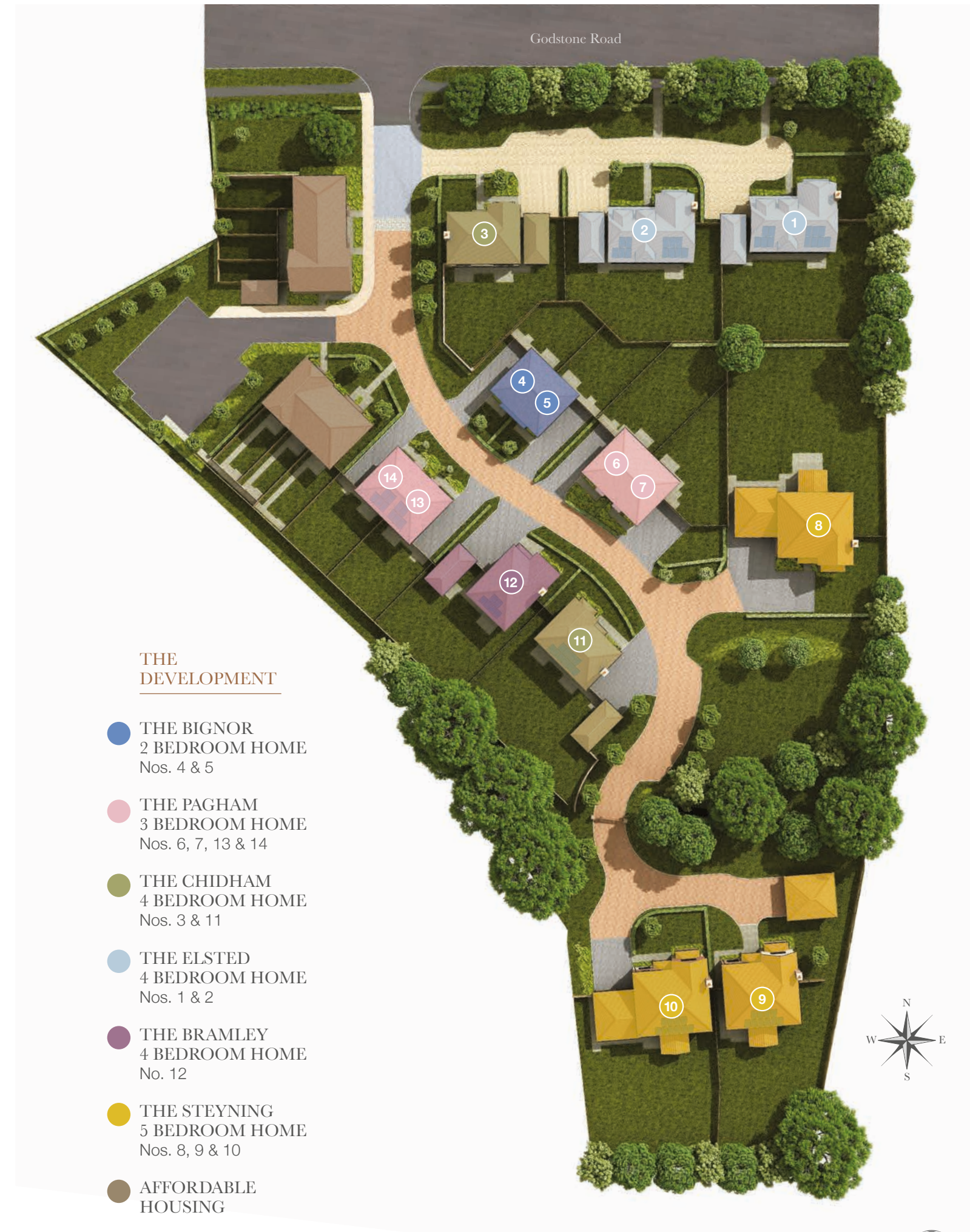
Computer generated image of the development shown is indicative only.

Knights Park is the perfect place to call home.