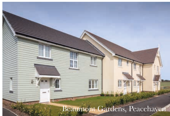
Beaumont Gardens, Peacchaven

Thakeham has a genuine passion to create superior quality homes, in the places where people really want to live.