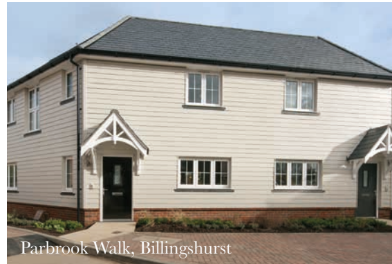
Parbrook Walk, Billingshurst