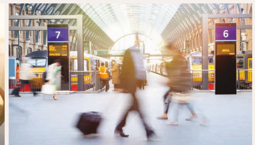
From top left: Sightseeing in London. A short drive to nearby Bluewater. London Gatwick Airport. On route to Kingston.