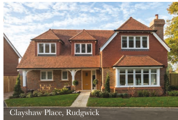
Clayshaw Place, Rudgwick