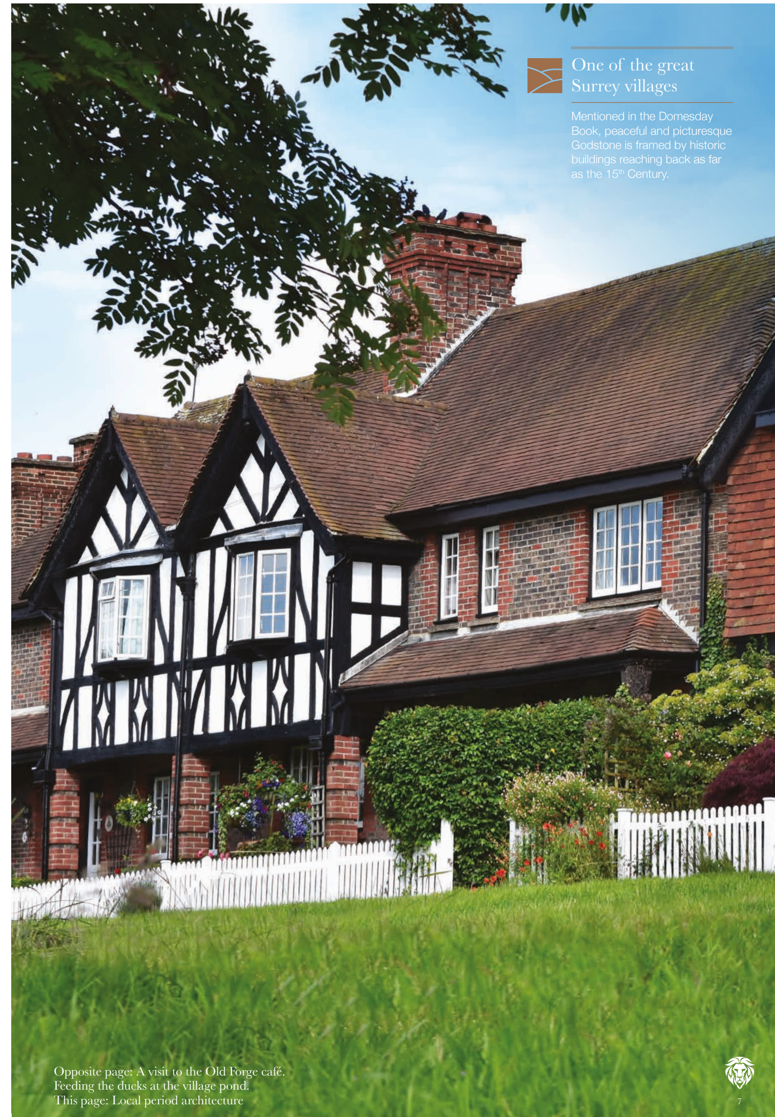
Opposite page: A visit to the Old Forge café. Feeding the ducks at the village pond. This page: Local period architecture

Mentioned in the Domesday Book, peaceful and picturesque Godstone is framed by historic buildings reaching back as far as the 15 th Century.