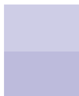
Plots 159 & 170 3 bedroom house