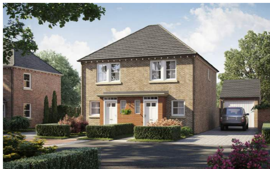
*Artists' impressions are intended to give only an impression of the house design.