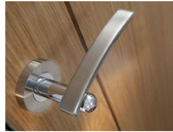
*Photographs typical of Mildren Homes properties, which may include optional upgrades available at additional cost.