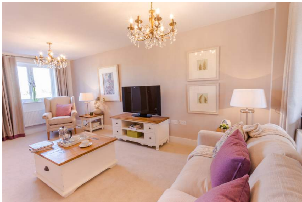
*Photographs typical of Mildren Homes properties, which may include optional upgrades available at additional cost.

Passionate, dedicated and committed, our ethos of creating sustainable communities of desirable new homes sets us apart from other developers; you can trust Mildren Homes to deliver a new home that you will enjoy for many years to come.