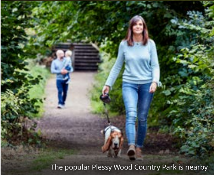
The popular Plessey Wood Country Park is nearby