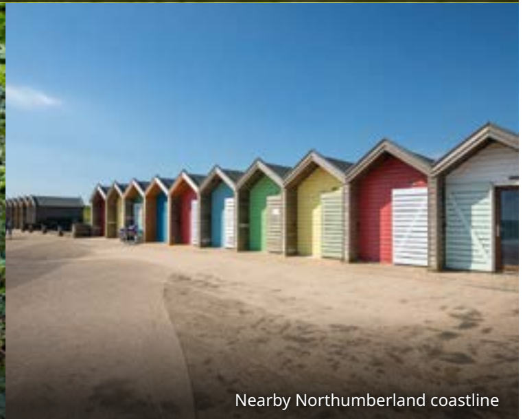
Nearby Northumberland coastline