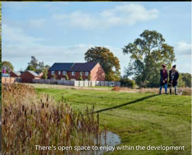
There's open space to enjoy within the development