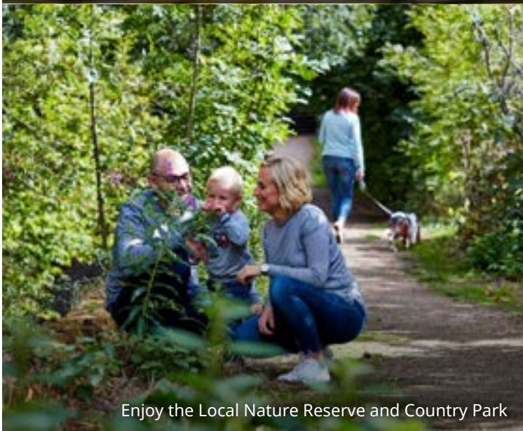
Enjoy the Local Nature Reserve and Country Park

Nearby city of Durham is full of historical charm