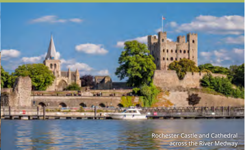
Rochester Castle and Cathedral across the River Medway