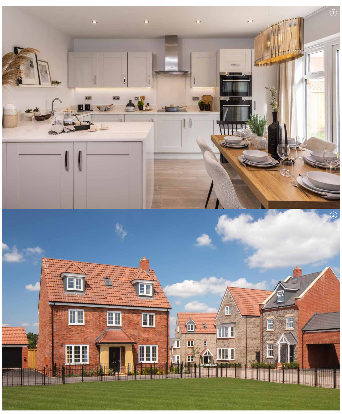
\overbrace{ \textbf{1} } \, \hookrightarrow \, \mathsf{Typical} \,\, \mathsf{Interior} \,\,