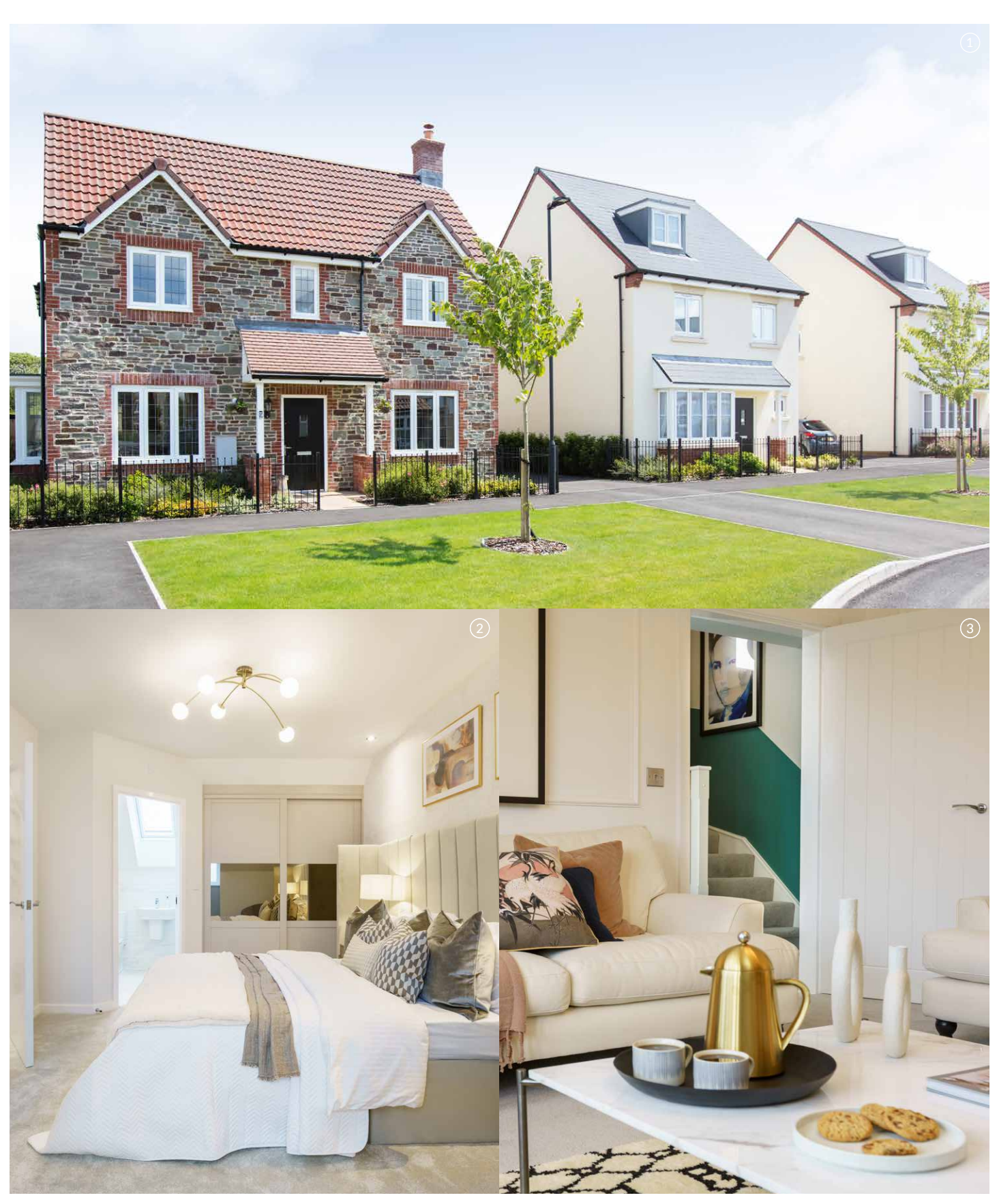
1 → The Fairways, Bindfield