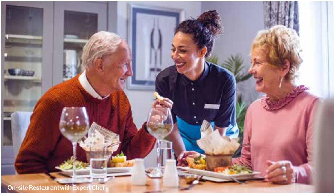
On-site Restaurant with Expert Chef