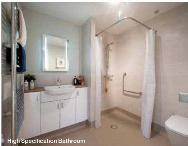
High Specification Bathroom