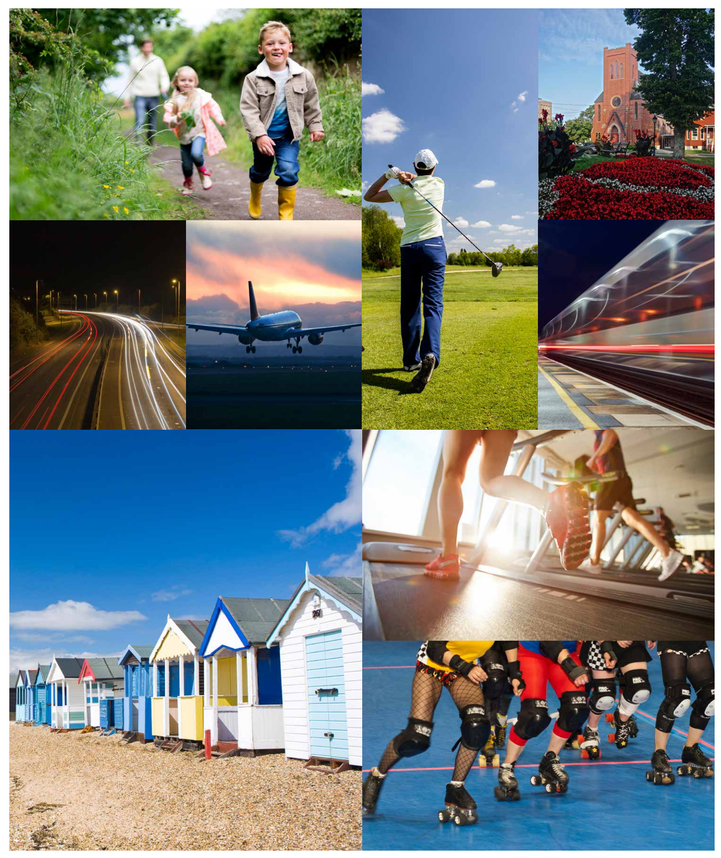
\hookrightarrow Images for illustration purposes only