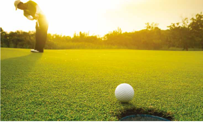
→ Images for illustration purposes only. All details correct at the time of production.