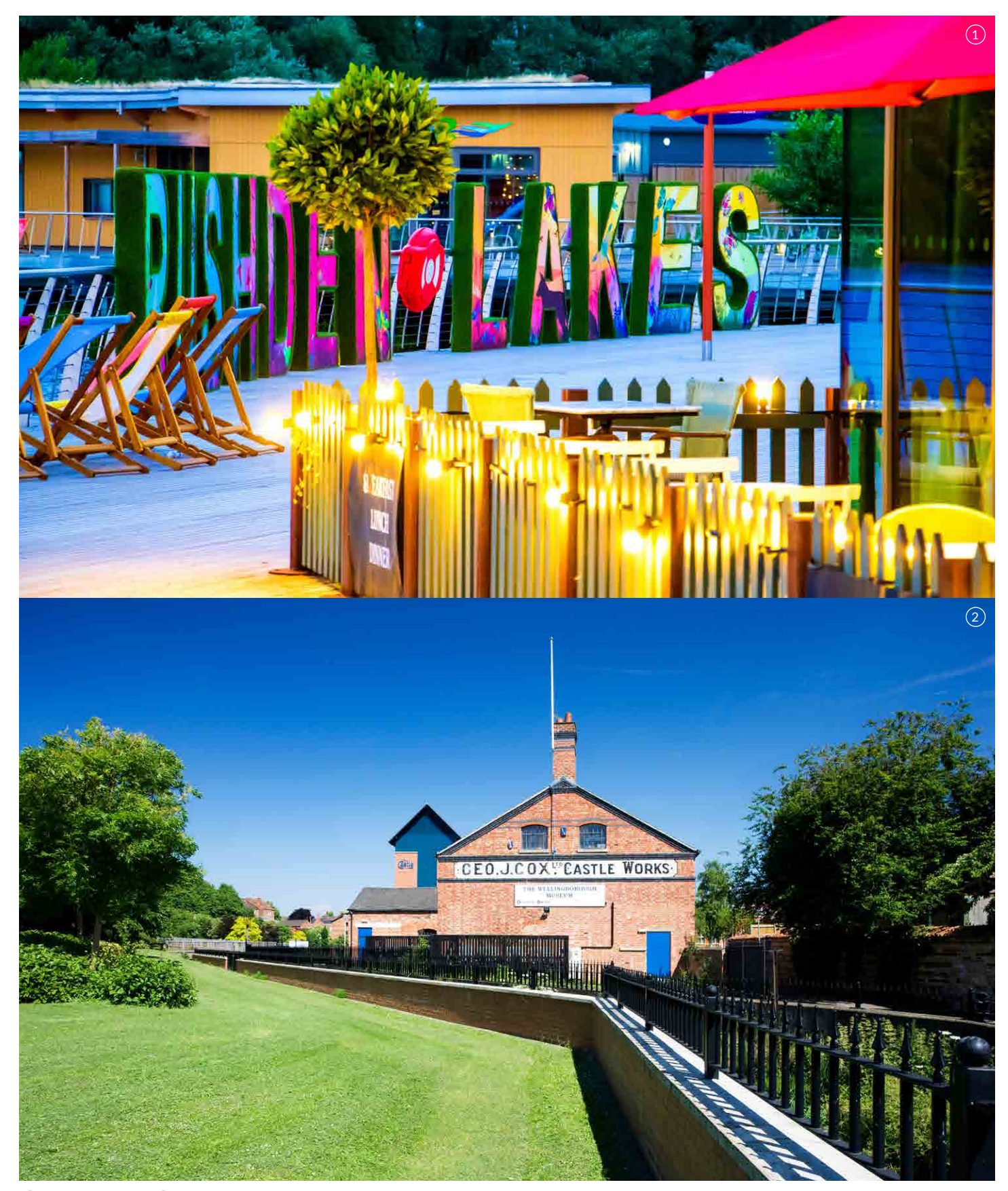
\textcircled{1} \hookrightarrow \mathsf{Rushden \ Lakes} \qquad \textcircled{2} \hookrightarrow \mathsf{Wellingborough \ Museum}