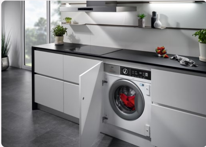
Options availability is subject to build stage of plots and options won't be available if plots have reached a certain build stage. Please contact the Sales Executive for further information.