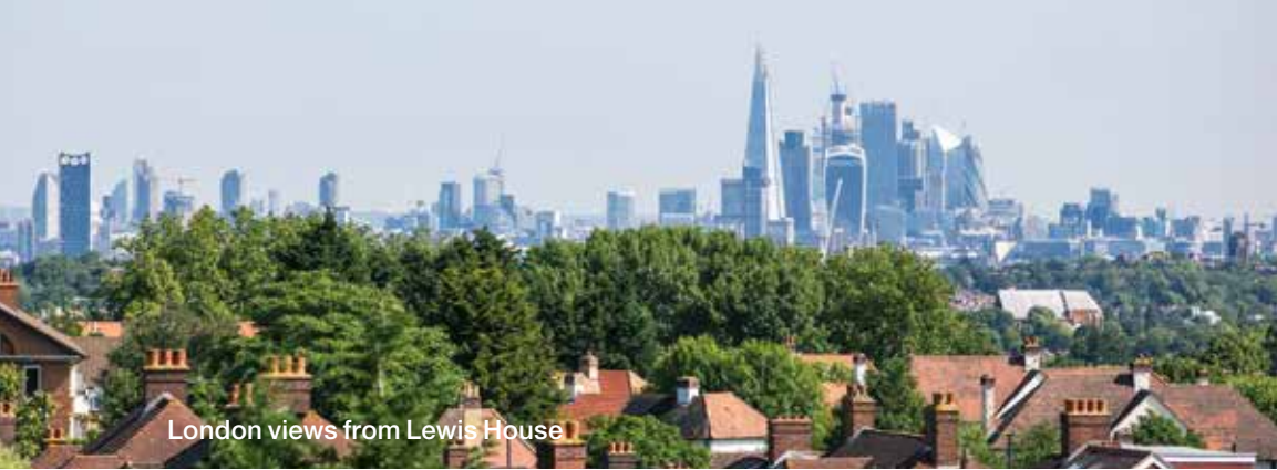
London views from Lewis House