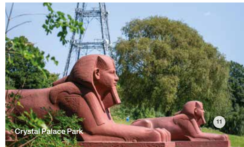
Crystal Palace Park