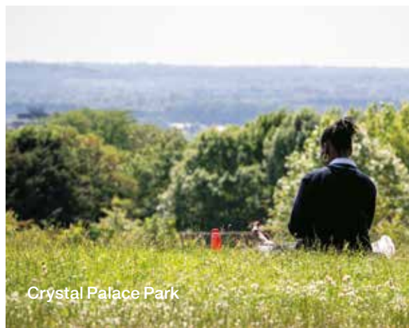
Crystal Palace Park