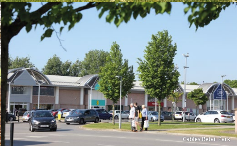
Cables Retail Park