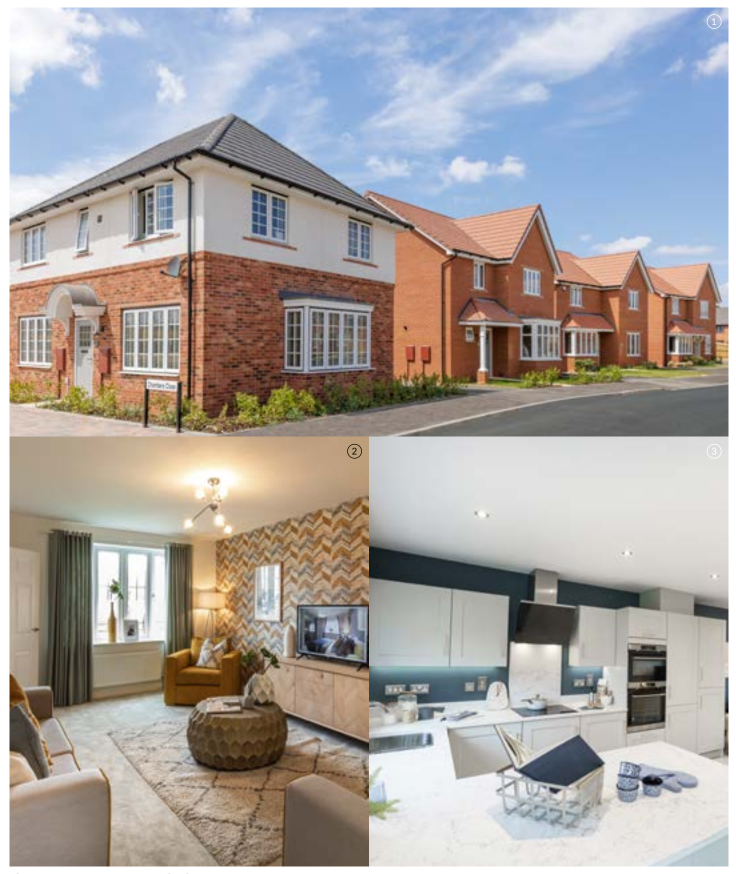
(1) \mapsto Wavendon Green Street Scene (2) (3) \mapsto Typical Interiors of lounge & kitchen