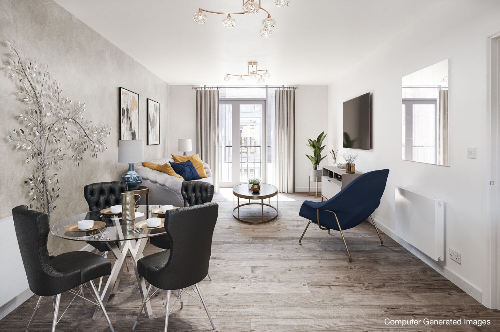
Computer Generated Images