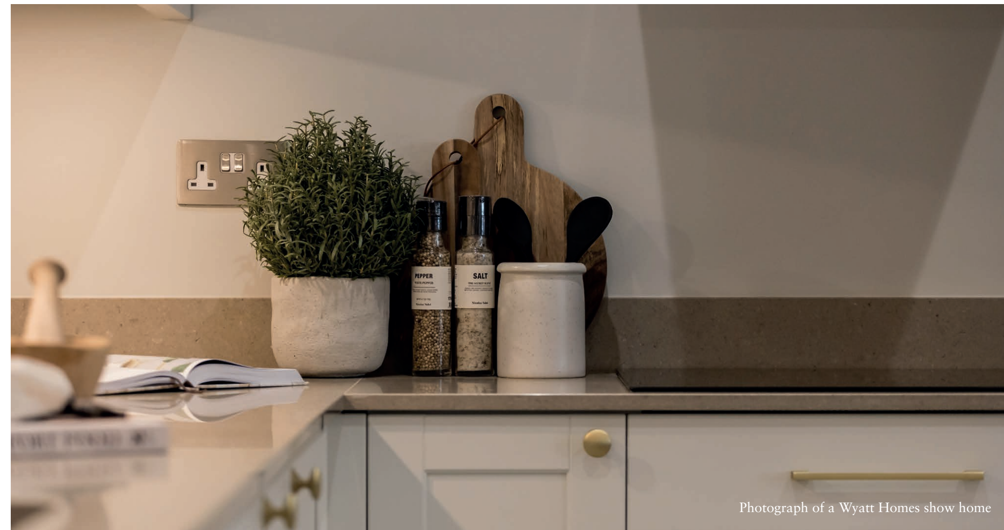
Photograph of a Wyatt Homes show home