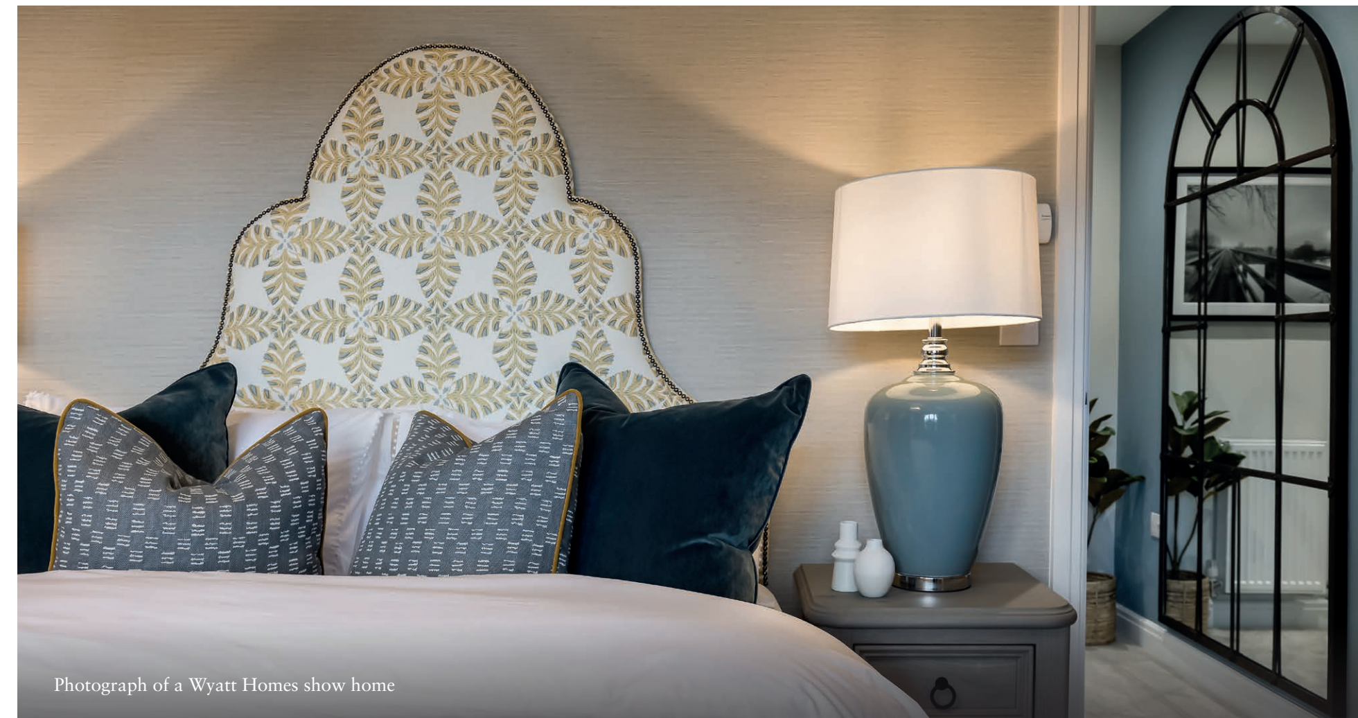
Photograph of a Wyatt Homes show home