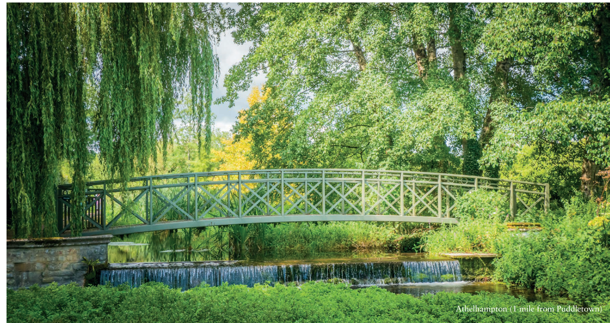
Athelhampton (1 mile from Puddletown)