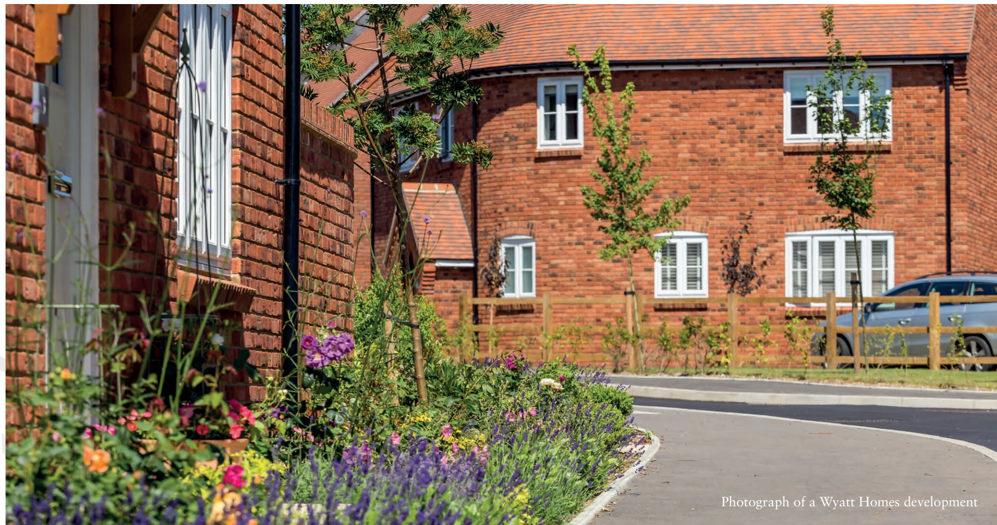
Photograph of a Wyatt Homes development