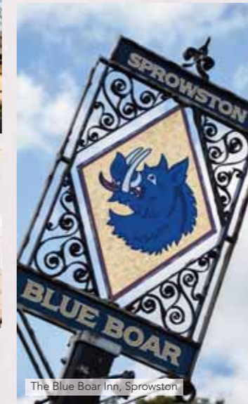
The Blue Boar Inn, Sproston