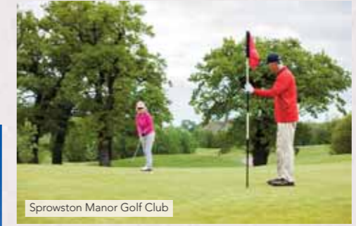
Sproston Manor Golf Club