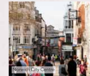
Norwich City Centre