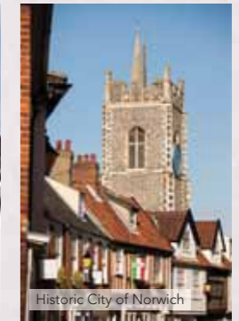
Historic City of Norwich