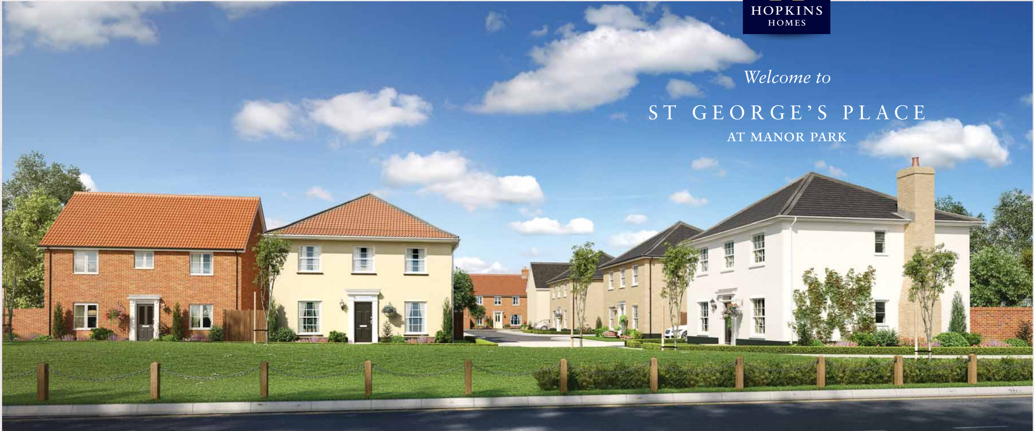
Computer generated image of properties at St George's Place. Indicative only.