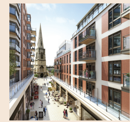
17. Market Street